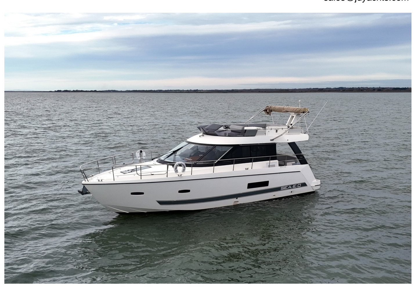
SEALINE F42 SEA E O

Tel: +44 (0)1305 766 504 sales@jdyachts.com