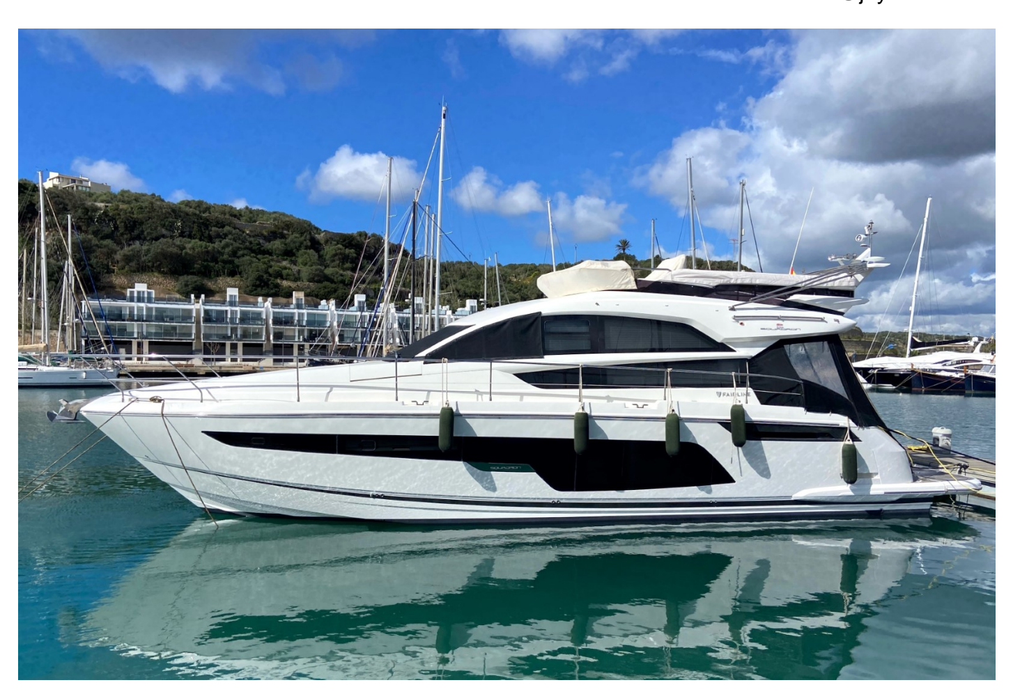
FAIRLINE SQUADRON 48

Tel: +44 (0)1305 766 504 sales@jdyachts.com