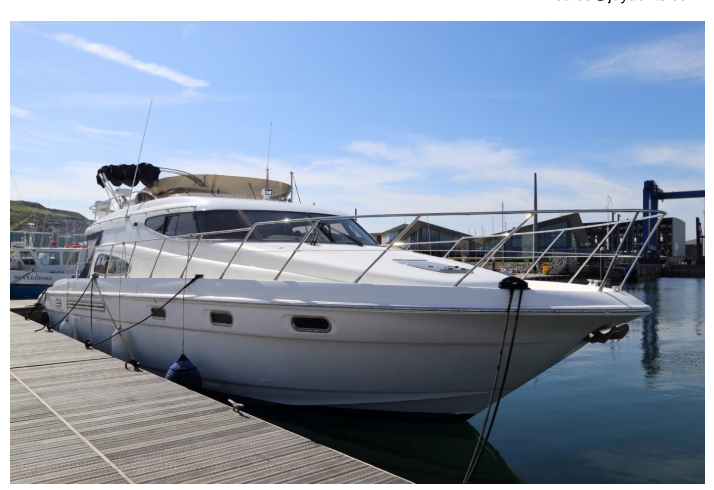
SEALINE T51 WAKEY WAKE

Tel: +44 (0)1305 766 504 sales@jdyachts.com